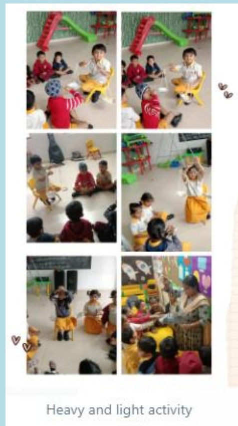
Heavy and light activity