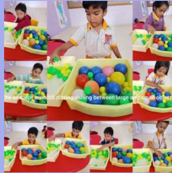
The concept is about distinguishing between large and small objects