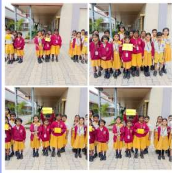
Particles arrangements in solid state with Kneading Dough. Grade 3