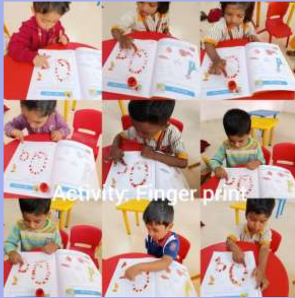
Activity: Finger print