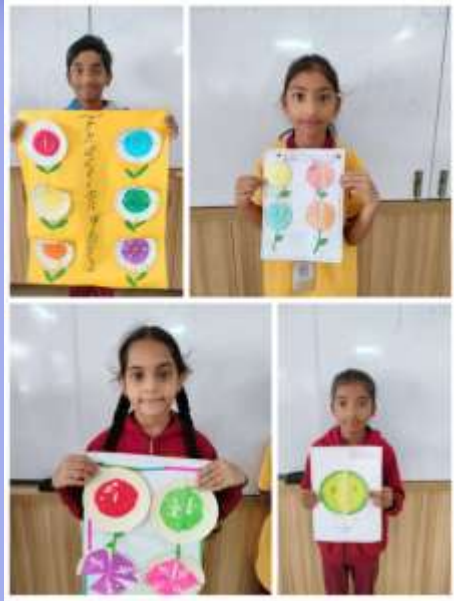
Making of fraction flower grade 4