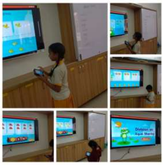
Division concept. Activity: learning by playing games.