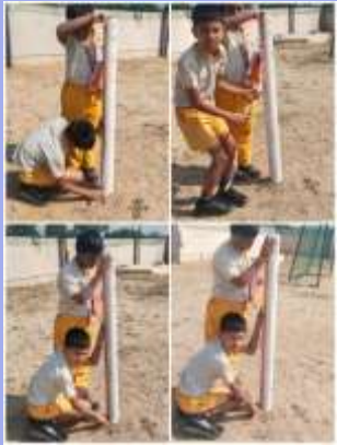
Grade 5 math activity on Measurement