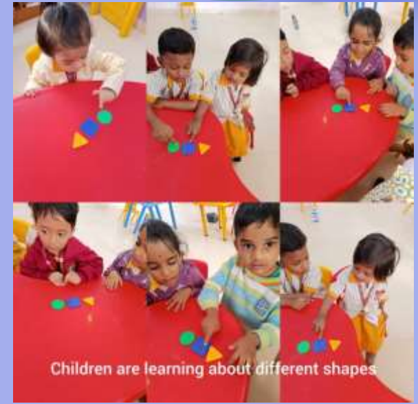
Children are learning about different shapes