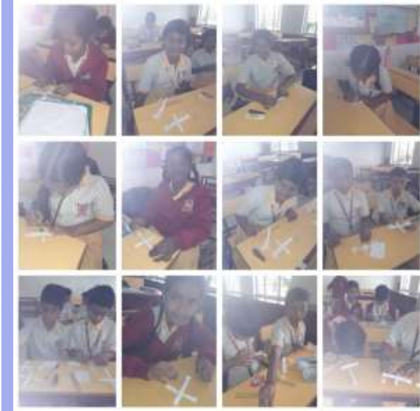
Activity on simple machine first grade level