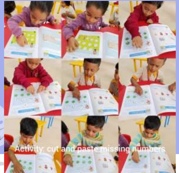
Activity: cut and paste missing numbers