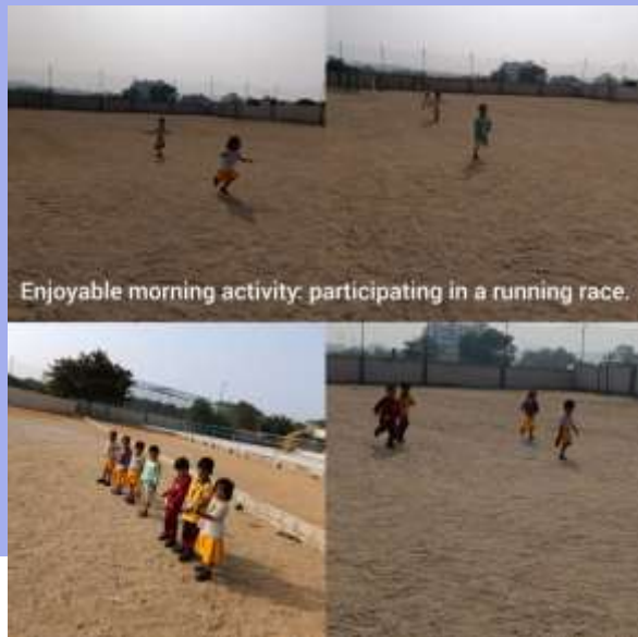
Enjoyable morning activity: participating in a running race.