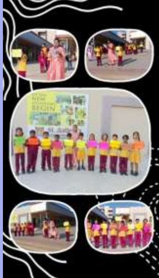
Division by Equal sharing