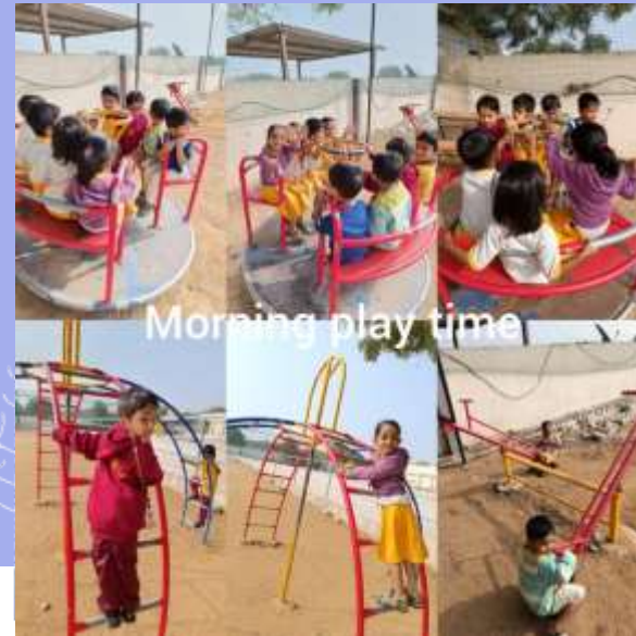
Morning play time