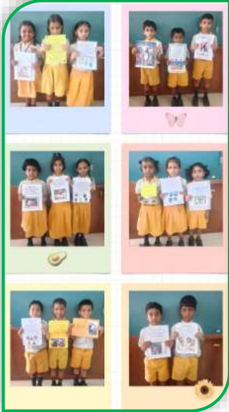
Grade 1 – Speaking about their family