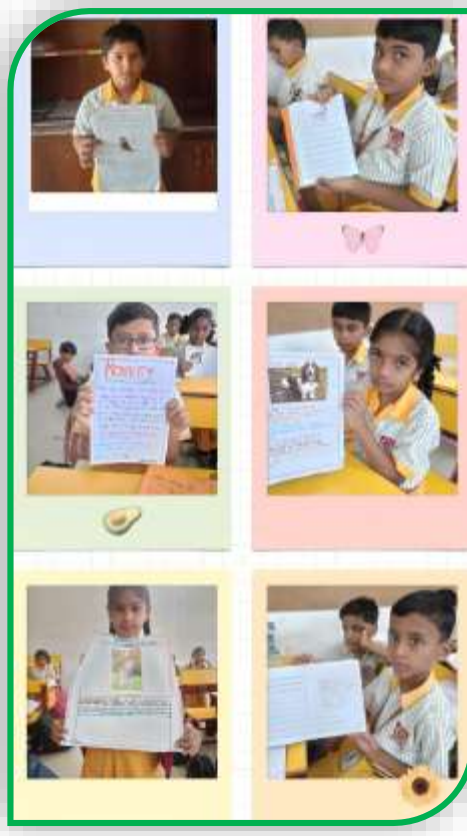
Grade 4 – Speaking about pets