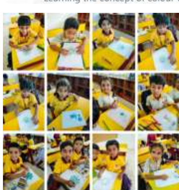
Poster making by grade 1