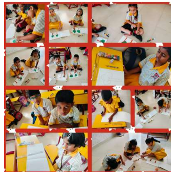
Learning the process of converting hue into tint( Grade 2)