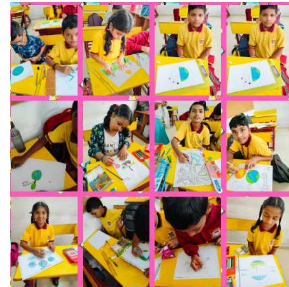
Poster making by grade 5