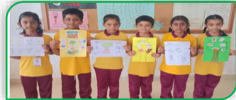
Uses of plants and parts of plants – Grade 2