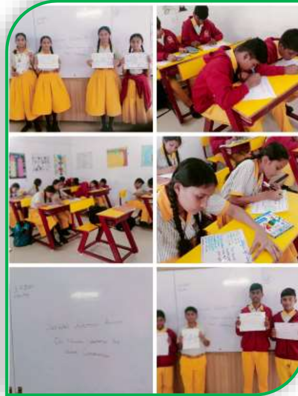
Slogan writing on wildlife conservation