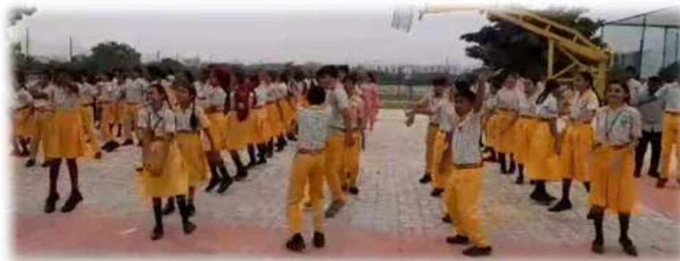
Mass drill on Saturday – Fitness – Zumba and Yoga