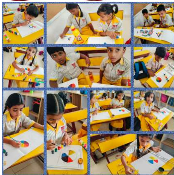
Learning the concept of colour wheel ( Grade -3)