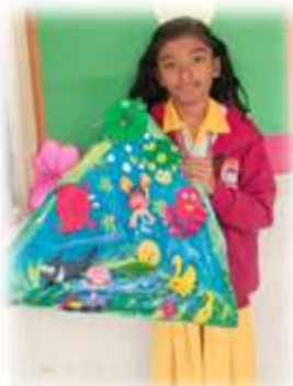
Grade 6 – making of Habitat