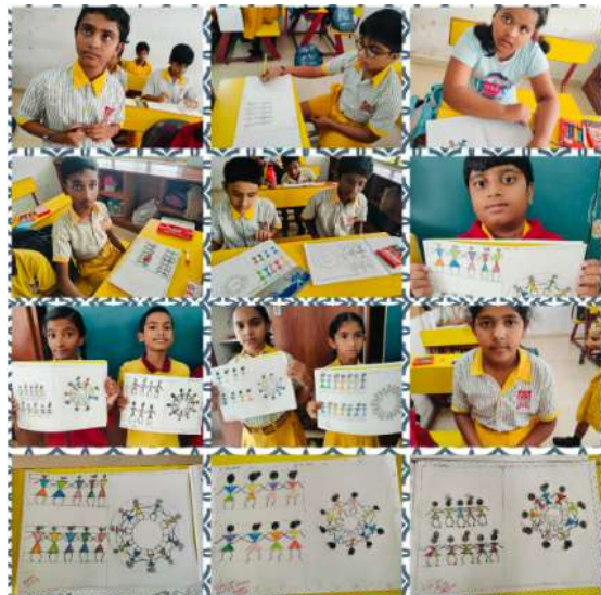
Warli Art by Grade-5