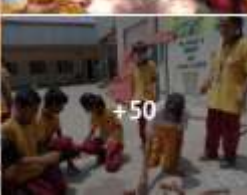
Grade:9 Osmosis experiment with dry raisin